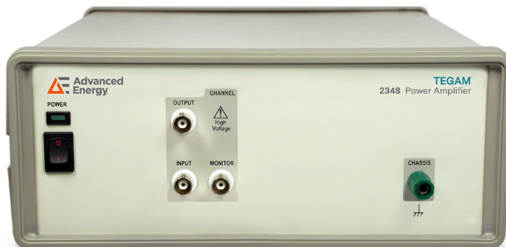
Figure 1: No Load and Full Load Gain (dB) vs. Frequency (Typical)

Amplifier Gain measured at 50 Vp-p Bandwidth 2.0 MHz (-3 dB cutoff).